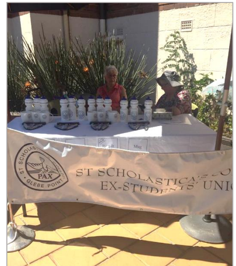
Ex-Students' Union Stall at College Open Day March 2018