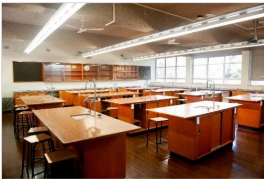
Old Science Lab

Here are some before and after photos of the Science Labs, completed in January this year.