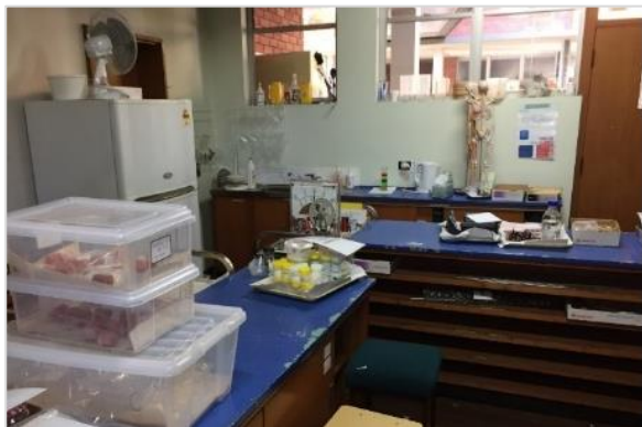
Old Science prep room