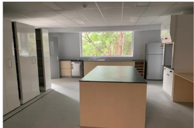
New Science prep room