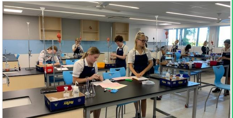
New Science Lab