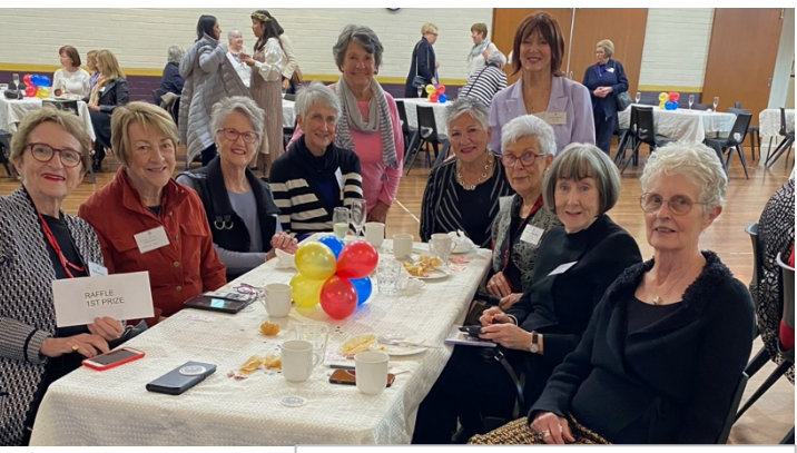
Class of '63 having lunch in the TFC

There are many more and varied learning spaces, more students, a different uniform (no more cap hats and gloves!), no nuns teaching and lots of air-conditioning!